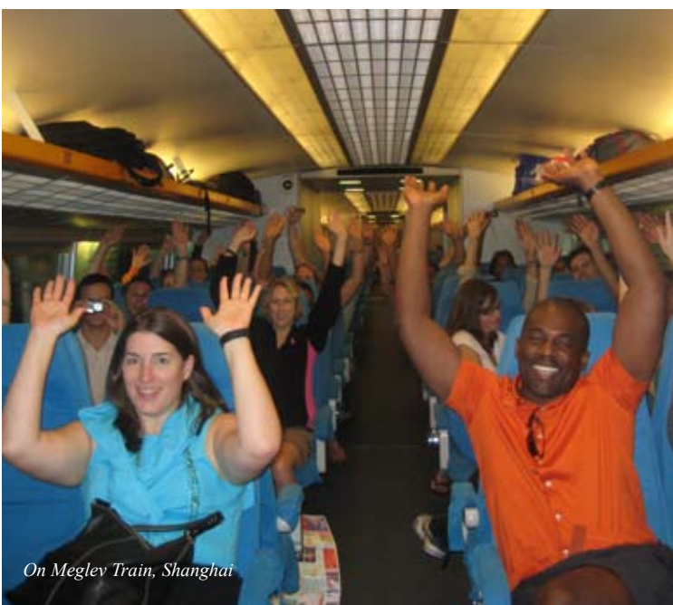
On Maglev Train, Shanghai